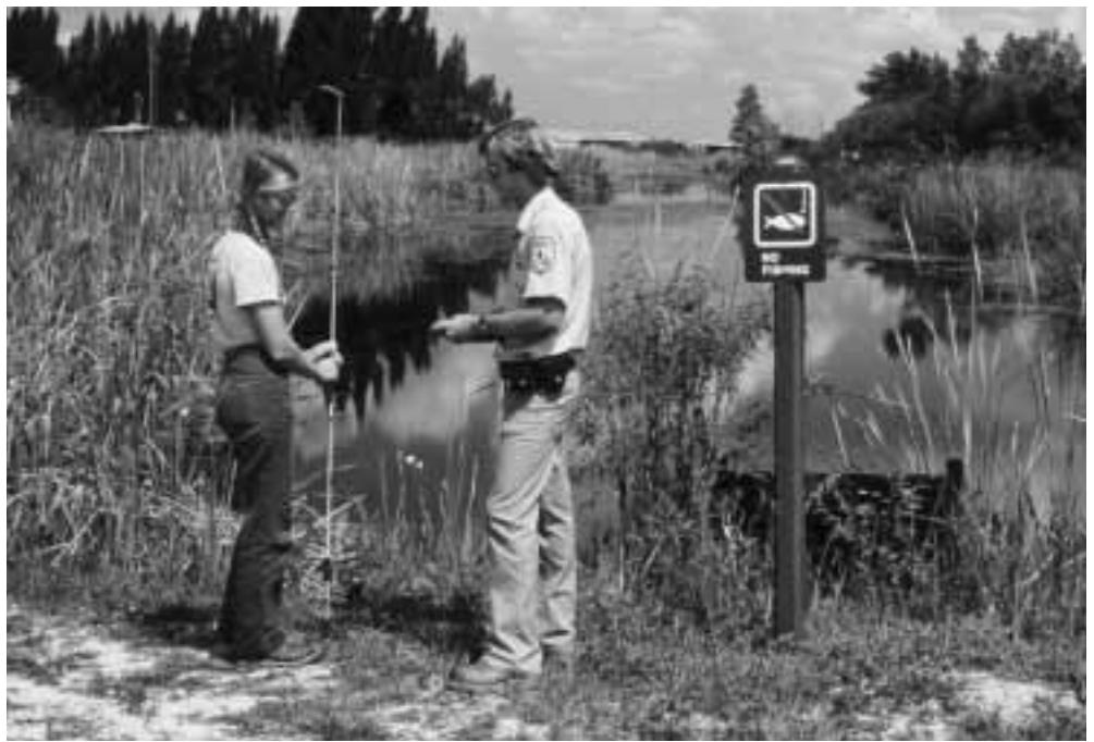
Regulation enforcement.