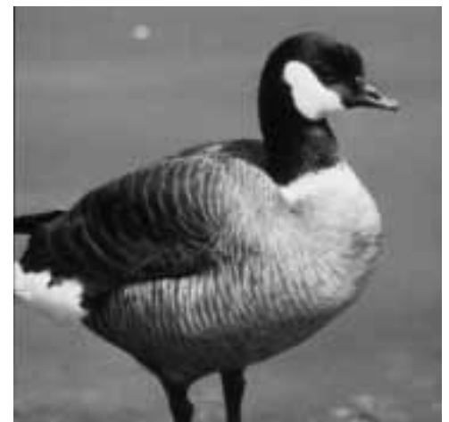
Aleutian Canada goose.