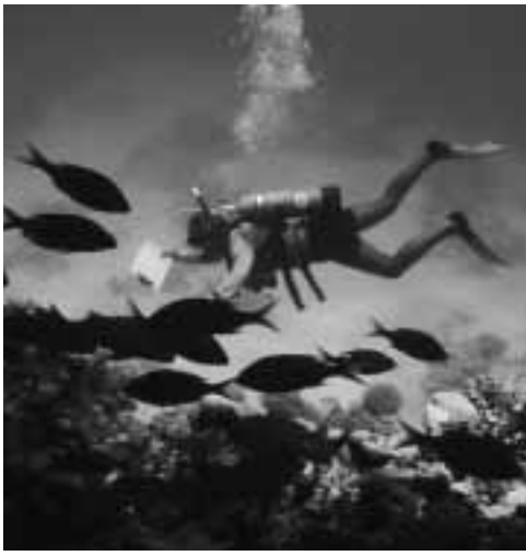
Fish survey.

interagency effort to analyze U.S. trade data for corals, sea horses, and live reef fish and propose improved trade controls. Service wildlife inspectors took the lead in planning, coordinating, and conducting a marine invertebrate identification workshop for North American wildlife law enforcement officers; this well-received training promises improved enforcement of existing trade laws that protect corals and other marine species at U.S., Canadian, and Mexican ports of entry. Service law enforcement also secured the first Federal felony conviction for coral smuggling in a Florida case that involved illegal trafficking in corals plundered from reefs in the Philippines.