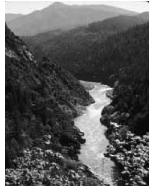
Klamath river, CA.

the Service listed the shortnose and Lost River suckers as endangered, citing the decline in water quality and quantity in the basin as major reasons for the decline.