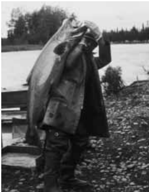
King salmon.

Partnership programs in Alaska also focused on riparian habitat important for spawning and rearing salmon. Alaskan restoration partnerships were recognized with two of only four national Coastal America Partnership Awards in 1999: the multi-agency/public effort to restore Duck Creek, an impaired body of water flowing through the City of Juneau; and the Kenai River 50:50 Program, a multi-agency/public effort to restore riparian habitat on public and private lands along the Kenai River.