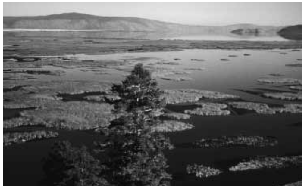
Upper Klamath NWR.