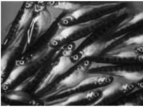
Salmon in "button up" stage.