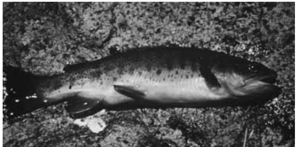
Gila trout.

The National Fish Hatchery system has continued a vigorous effort to restore native fish species that have wide recreational value.