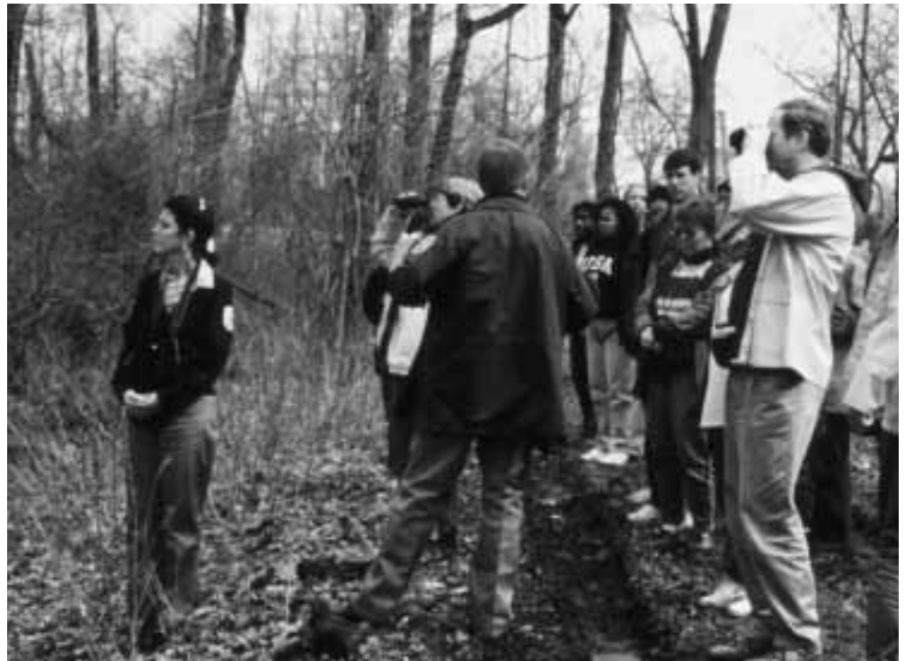
Enviromental tour.

To inform even more citizens of the wildlife-dependent recreational opportunities available on the Refuge System, the Service prepared a series of six theater slides that began appearing on screens at more than 1,000 movie theaters nationwide, thanks to public service time generously donated by an on-screen advertising company, Century Media Network. In addition to photographs displaying the natural beauty of the System itself, the slides encourage viewers to call the Service's toll-free phone number or visit an online website to learn more about the Refuges. The "Virtual Visitors Center" website was developed for use as a Refuge homepage to encourage online viewers to visit a Refuge. The site also gives viewers an opportunity to experience what they may see and learn at individual refuges, so they too can share our excitement about these irreplaceable wonderlands.