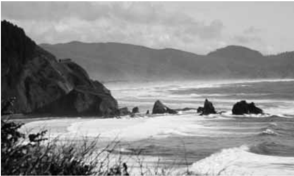
Oregon coast.

inter-agency effort to implement spartina control measures in northern Puget Sound.