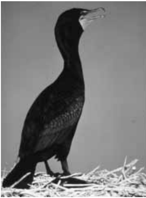
Double-crested cormorant.

The effect of cormorants on fish populations in open waters is somewhat less clear than at aquaculture facilities. While cormorants can, and often do, take fish species that are valued by commercial and sport anglers, these species usually make up a very small proportion of the birds' diet.