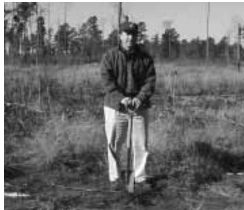
Red-cockaded Woodpecker Safe Harbor Program.

The "Safe Harbor" policy is already making a difference on the ground, and has become an important tool in the recovery of the Attwater's prairie chicken, one of North America's most endangered birds. The Attwater Prairie