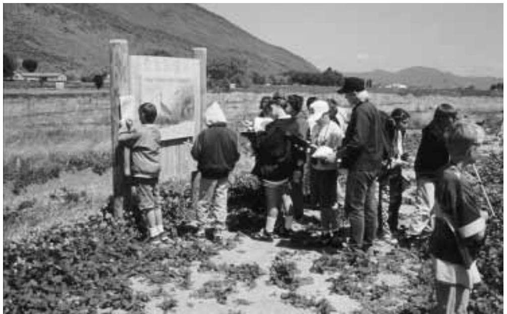
Environmental education.

This action stemmed from work which began in our New England Field Office in 1994. We’ve worked together with the North American Loon Fund developing “Let’s Get the Lead Out,” a brochure encouraging anglers to switch to nontoxic fishing tackle. Recognizing that a number of outreach efforts on the lead issue are ongoing throughout New England, the Service hosted a Lead Sinker Outreach Meeting and brought together