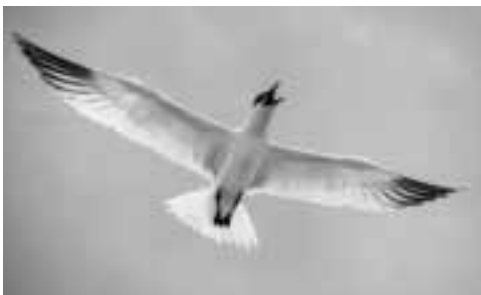
Caspian tern.

Working with the Army Corps of Engineers, Columbia River Intertribal Fish Commission and the National Marine Fisheries Service, the Service also developed a management plan to tackle a very different overpopulation problem. These joint efforts paid off in a successful strategy to relocate a population of Caspian terns and reduce its depredation on salmon in the Columbia River.