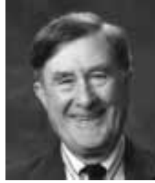
Senator John Chafee