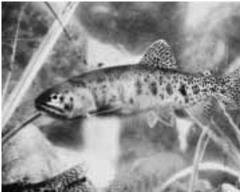
Rio Grand cutthroat trout.

Mexico Department of Game and Fish to draft a Memorandum of Agreement for management and restoration of the Rio Grande cutthroat trout.