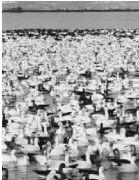
Snow and white-fronted geese.

In Anchorage, where a growing population of migratory urban geese poses increasing safety threats, the Service led the formation of the Anchorage Waterfowl Working Group, a coalition of agencies and NGOs tasked with developing a strategy for goose population management. The annual growth rate of geese has dropped from 15 percent to 6 percent as a result of collecting eggs and donating them to Alaska Native elders as traditional food, relocating goslings to refuges outside of Anchorage, and lethal control of problem geese at airports. An extensive outreach campaign has accompanied the management activities and is producing results.