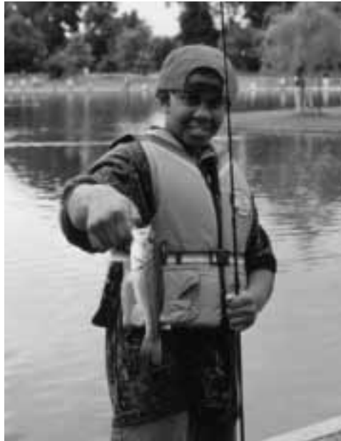
Fishing.