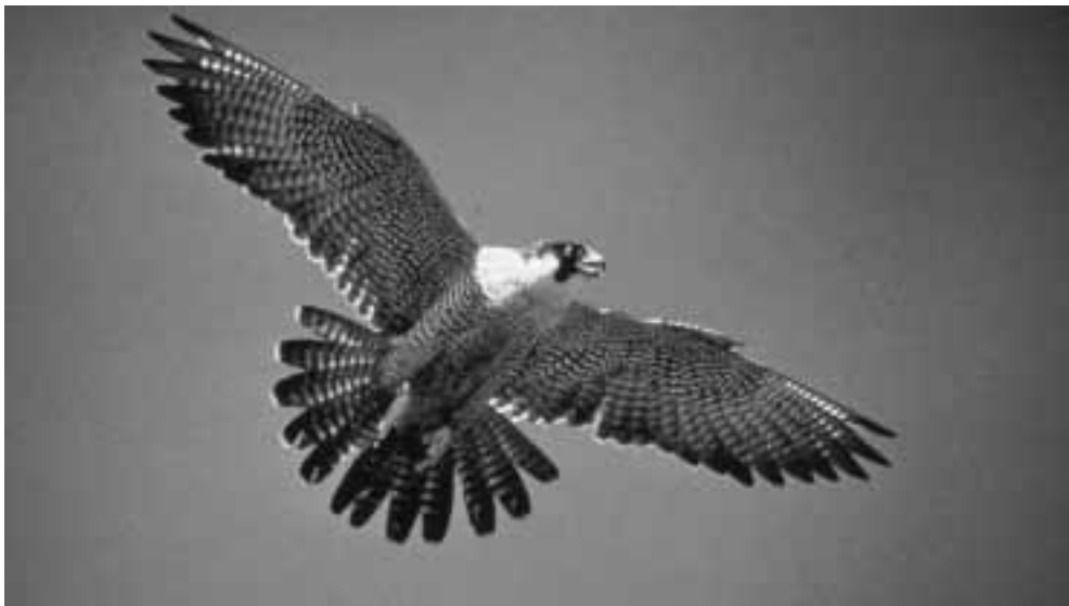
Peregrine falcon.

The proposed delisting of the Aleutian Canada Goose is an Endangered Species success story unlike any other. The bird's recovery is a result not of a single action or recovery effort, but of a suite of recovery efforts by a network of dedicated individuals. The eradication of introduced foxes from nesting islands in the Aleutians, implementation of hunting restrictions and development of sanctuaries on the geese' wintering grounds in California, Oregon and Washington paved the way for recovery.