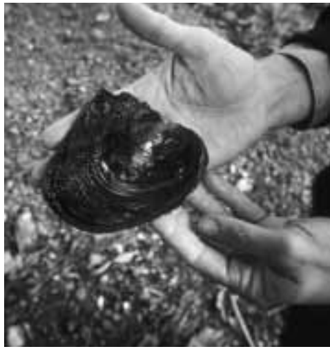
Freshwater mussel.

Service special agents and State conservation officers closed out a major multistate investigation of illegal trafficking in freshwater mussels — a threat to both clam species and ecosystems in the Nation's heartland. The investigation, which broke up a poaching operation spearheaded by the country's second largest shell exporter, resulted in the conviction of the company, its president and vice-president, and six other individuals. Penalties assessed