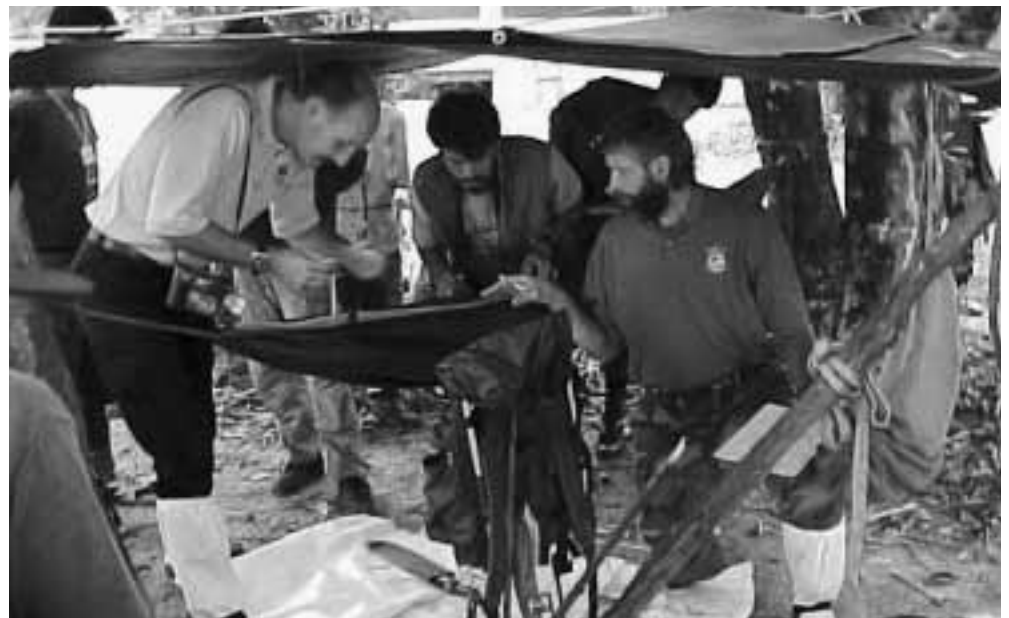
Training in Thailand.

Service special agents and wildlife inspectors proved the instructors of choice for countries seeking to upgrade their wildlife law enforcement capability. The Division conducted hands-on anti-poaching training for national park rangers in Tanzania in cooperation with the U.S. Agency for International Development and teamed with the Global Survival Network, Wildlife Conservation Society, and Thai Royal Forestry Department to launch an anti-poaching and community outreach campaign in that Asian nation's most famous national park. Service enforcement and international affairs staff joined the U.S. Department of Justice to promote wildlife conservation and improved trade monitoring in Madagascar — an island nation where wildlife resources are increasingly being plundered for the global black market. Wildlife inspectors and Office of Management Authority staff conducted CITES enforcement training for customs officers and wildlife protection officials in China. International enforcement partnerships also included investigative assistance in Kenya, where Service special agents helped probe an organized wildlife crime syndicate preying on elephants, rhinos, and other endangered African animals.