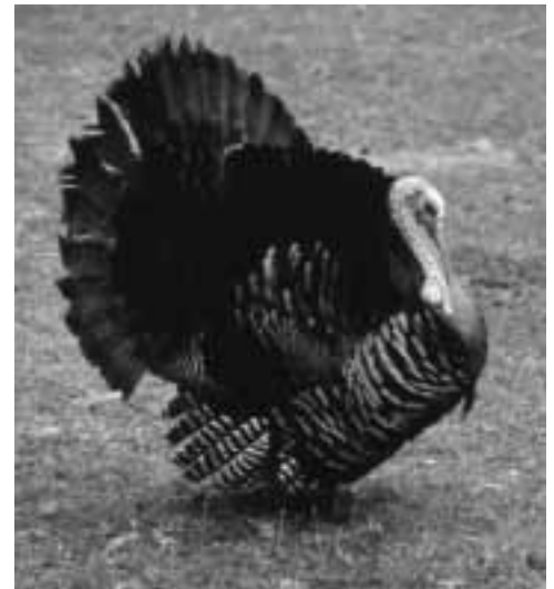
Wild turkey.

As always, volunteer and community groups — which provide invaluable local support for individual refuges — continued to display their commitment in