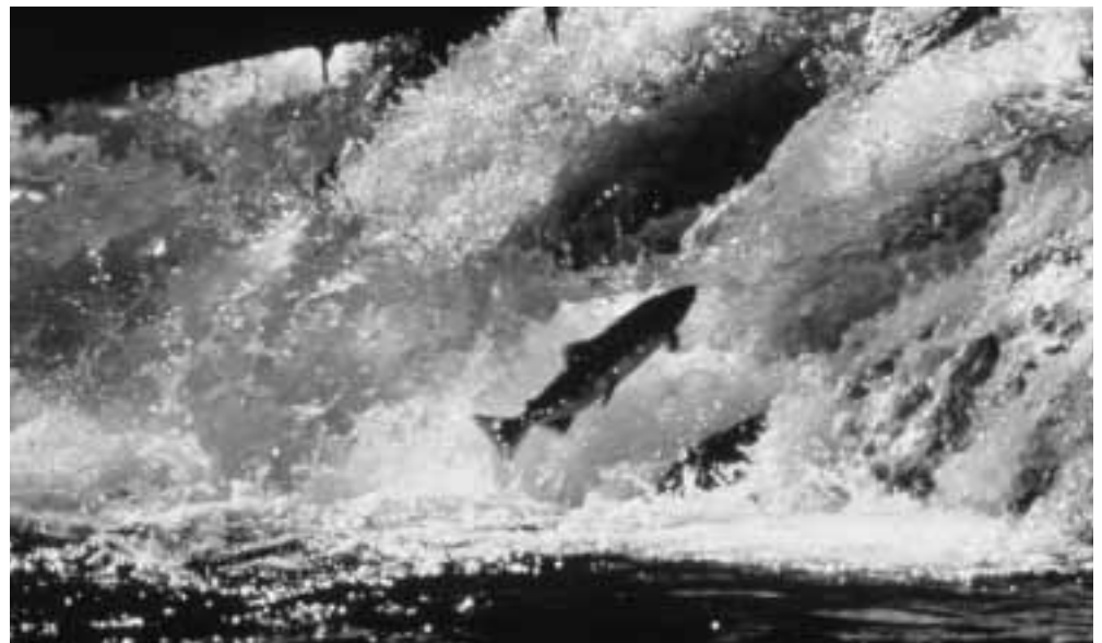
Pink salmon.

Similar efforts are underway on both coasts to promote salmon recovery. Through these partnerships, 71 miles of stream were opened up to anadromous fish in the Pacific Region. The Portland-Vancouver Metro Area Greenspaces Program successes involved restoration of 5 acres of wetlands, 22 miles of riparian and instream habitat and 27 acres of upland habitat associated with other trust species. Fifty miles of stream were opened to anadromous fish and 54 acres of off-channel rearing habitat were restored for salmon. The Service is also working with other Federal regional executives to develop solutions to Columbia River salmon problems, including a 1999 decision on operating the Federal dam system in compliance with the Endangered Species and Clean Water Act, and as a member of the Interagency Salmon Science Team charged with science-based salmonid restoration.