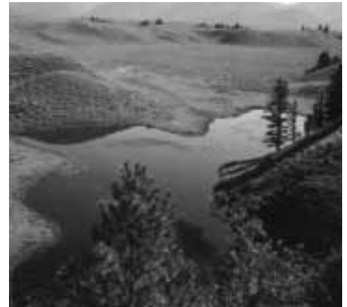
Restored Blackfoot Valley wetland.

In Montana, the Partners for Fish and Wildlife Program continued work in its Blackfoot Ecosystem Demonstration Weed Management Area. In the Blackfoot River watershed, the Service continues to bring together a diverse group of land management agencies, county weed control officials, State agencies, and private landowners to develop and implement a cooperative, integrated approach to vegetation management. The program has helped sponsor a number of workshops and tours to promote integrated weed management and has also contributed funds for the release of biological weed agents.