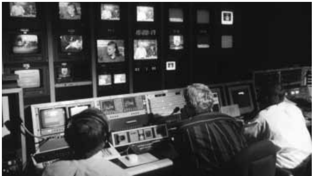
Distance learning broadcast.

We have continued our efforts in strengthening and diversifying the work force. This year we took a more holistic approach by looking at barriers that have impeded our progress and to address each specific issue on a Servicewide basis. Our efforts began with the dissemination of our Diversity vision that articulated the objective of a