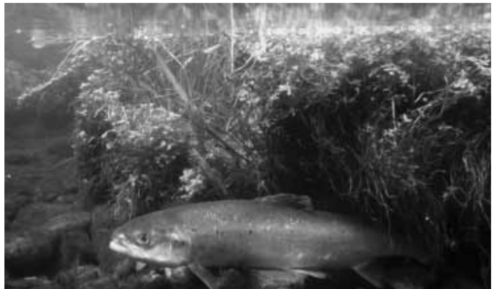
Atlantic salmon.

One New York-based case, for example, resulted in the nation's first Federal felony prosecution of a caviar importer for illegal trade. In October 1998, Service Special Agents apprehended seven individuals attempting to smuggle a total of 16 suitcases containing 901 (500 gram) tins of Beluga caviar.