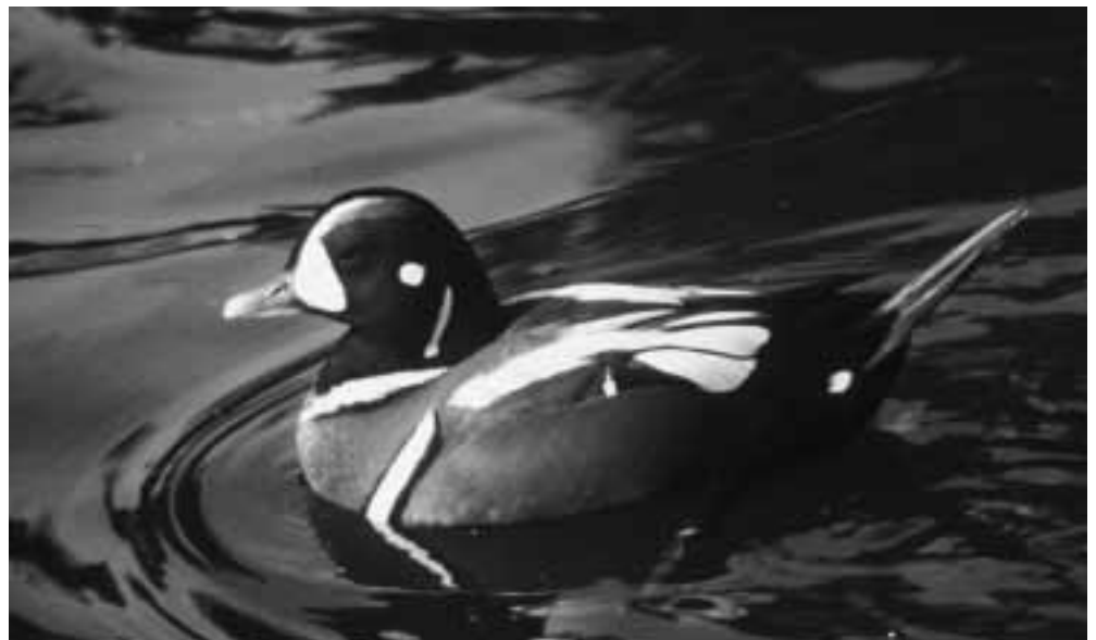
Harlequin duck.

Cooperative efforts with our counterparts in other agencies, and other nations, are providing many successful venues for migratory bird conservation. The North American Waterfowl Management Plan has provided us with an effective framework to work across borders on migratory bird conservation. This year, the North American Office established the Sonoran Desert Joint Venture, the nation's first joint venture with the role of delivering habitat conservation for all North American birds under national/international bird conservation plans. Based on the Western States Partners in Flight Plan, the new joint venture will operate to conserve threatened habitats in the Sonoran Desert region of the United States and Mexico.