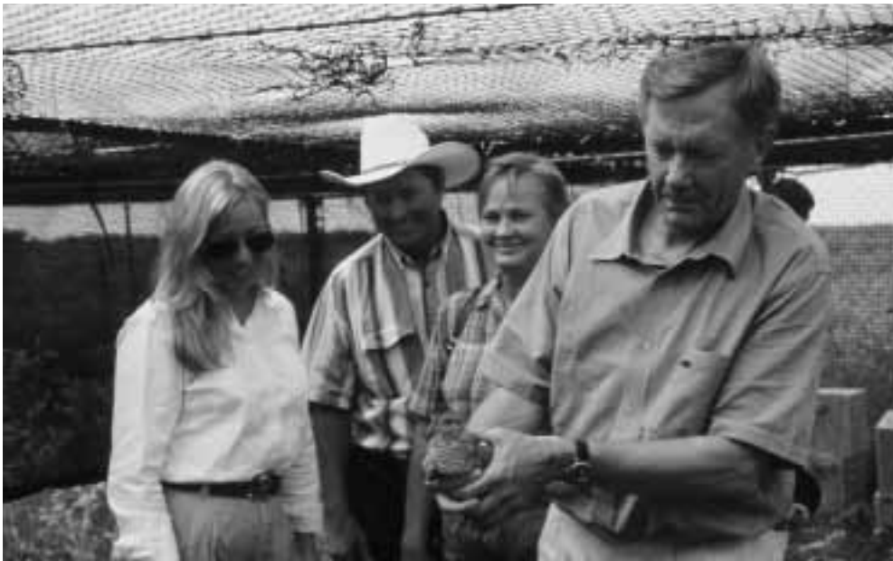
Attwater's prairie chicken project.

Two forest HCPs and associated permits were provided: one to the Pacific Lumber Company, including the largest tract of old-growth redwood forest remaining in private ownership, and another to the City of the Dalles, Oregon, which covered more than 200,000 acres. The six non-forest HCPs that were completed covered 4,891 acres, and ranged in size from 6 to 3,465 acres.