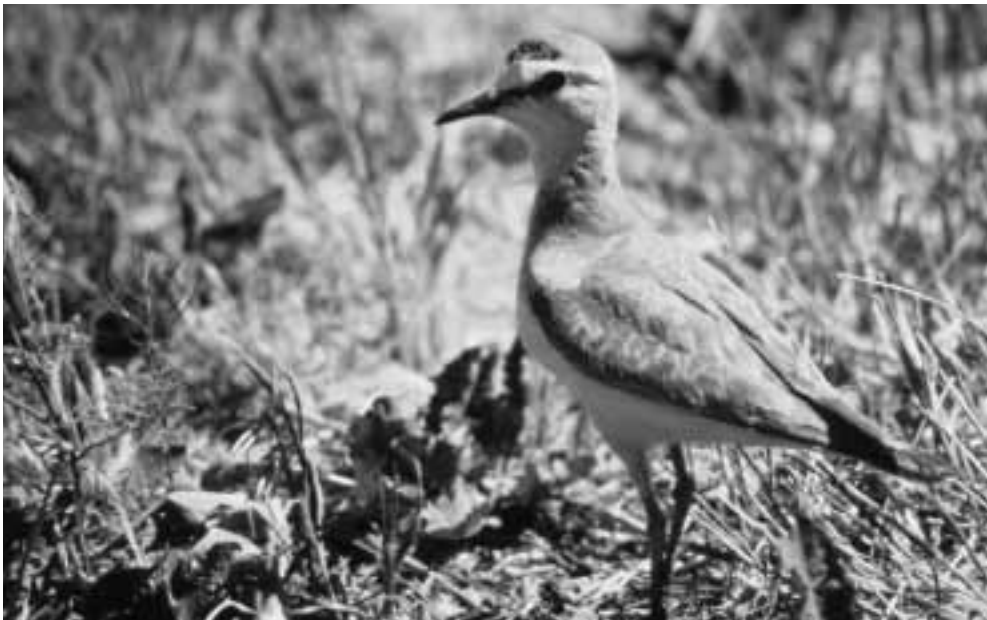
Mountain plover.

Here too, the policy is already providing measurable improvements in wildlife habitat. The lesser prairie chicken has been the focus of the High Plains Partnership. With ESA Landowner Incentive Program Funding, the Service is working with landowners to develop CCAAs. Voluntary conservation plans adopted this year on private land will restore 16,000 acres in New Mexico and 35,000 acres in Oklahoma. The declining swift fox, mountain plover, long-billed curlew, and burrowing owl, among others, are expected to benefit from these measures, as well as the black-tailed prairie dog. More than thirty landowners are currently on the waiting list to participate.