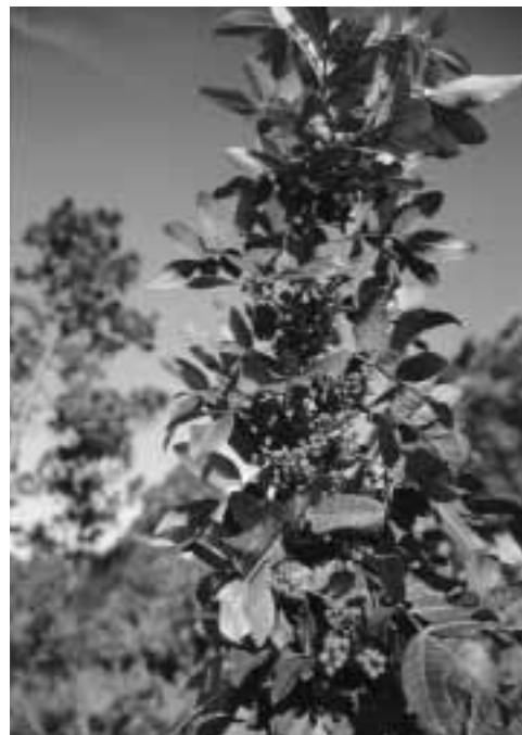
Brazilian pepper plant.

Refuges in Florida, including Egmont Key and Chassahowitzka, are making concerted efforts to remove Brazilian pepper, which forms a thick cover that chokes native vegetation. In addition to attacking the Brazilian pepper, Florida Panther NWR also held an invasive plant species workshop. More than 110 persons representing government agencies and private industry attended to discuss more effective methods to control invasive species.