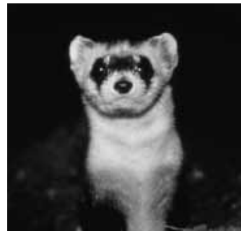
Black footed ferret.

HCPs are a particularly popular conservation tool in our nation's rapidly growing and changing west coast, where eight HCPs had been approved during the first nine months of this past year.