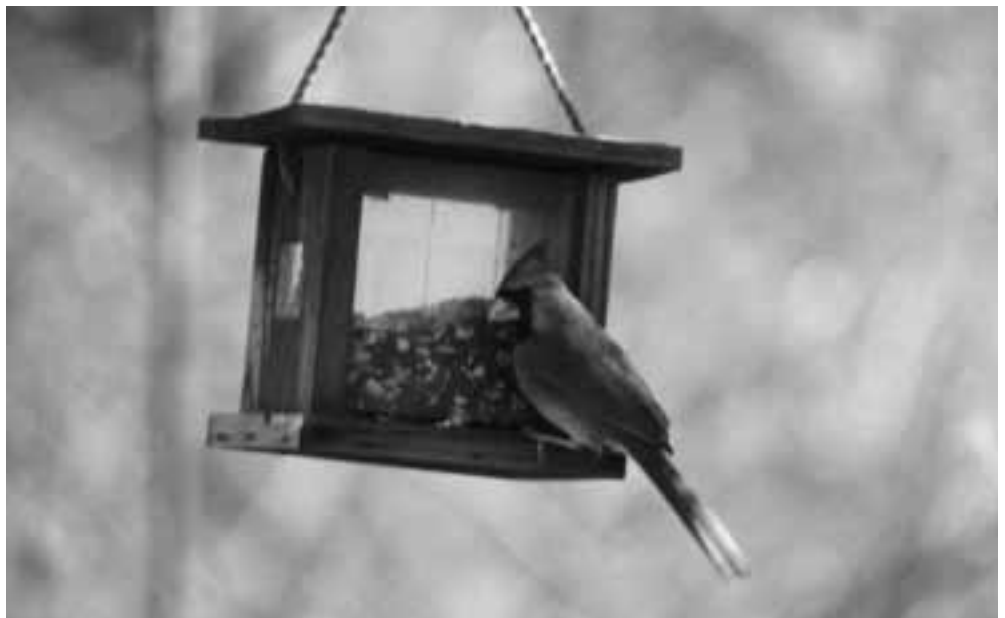
Backyard bird feeder.

Urban birds provide the only day-to-day contact with nature that many city dwellers enjoy. To help cities focus their bird conservation efforts, the Service and the City of New Orleans joined forces to sign the first Urban Treaty for Bird Conservation. The Urban Treaty program will provide a framework to support education programs, habitat restoration and enhancement, and other initiatives mutually agreed upon by the Urban Treaty city and the Service, in consultation with State wildlife agencies. Cities that sign an Urban Treaty for Bird Conservation with the Service may be eligible for matching grants, technical and educational assistance and other support. The Service will also work with the city to find other conservation partners for Urban Treaty initiatives.