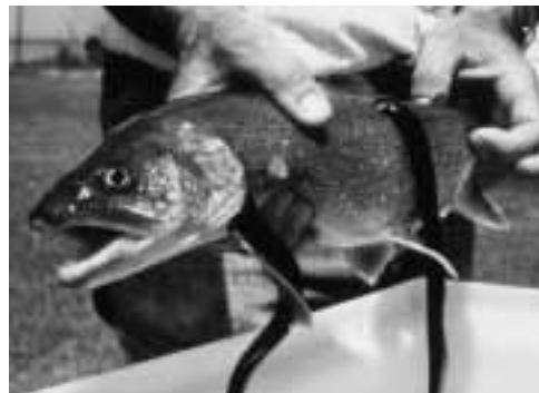
Sea lamprey on apache trout.

planning to install an electrical fish barrier in the Chicago Ship and Sanitary Canal next year to help limit the spread of the goby and other nonindigenous fish between the Great Lakes and the Mississippi River Basin. Even then, we’ll need to keep our eye on round goby distribution in the Chicago-area waterways to evaluate the effectiveness of the electrical fish barrier and the need for additional control measures.