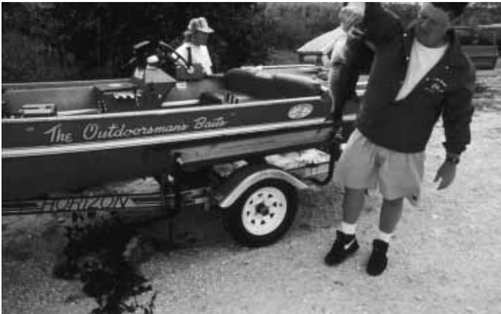
Fishing at Loxahatchee NWR.

streams, and important trust assets of the Hoopa Tribe. As one of the Department's lead agencies, the Service continues to play a key role in the CALFED negotiations, a critical ecosystem approach to water use and environmental restoration and enhancement.