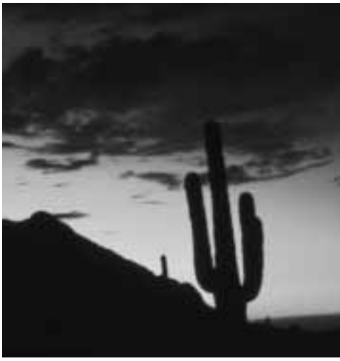
Sunset in Sabino Canyon.