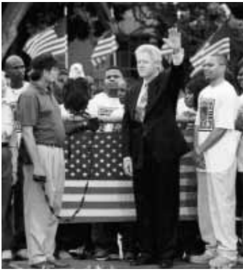
Bald eagle ceremony, proposal for delisting.