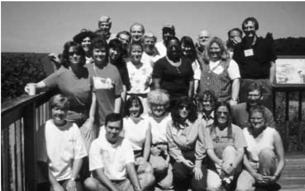
Volunteer workshop.