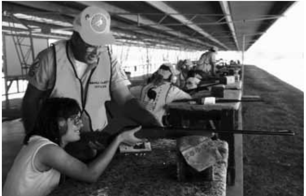
Hunter safety course.