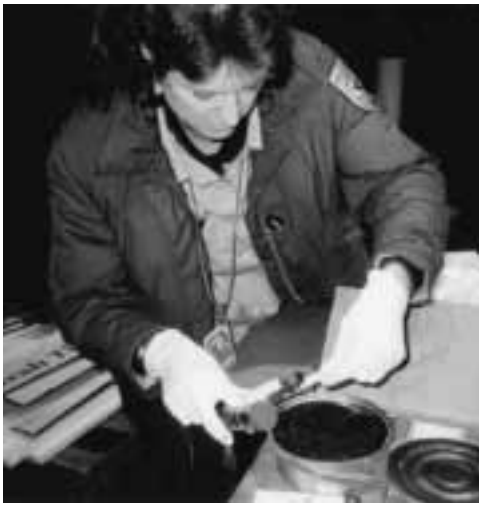
Inspecting caviar.

The total weight of the caviar seized was approximately 1,000 lbs, with an estimated value ranging from $675,000 to more than $1.1 million. Three individuals were arrested and charged with violating the ESA and CITES, and with felony conspiracy and smuggling charges. Service Special Agents later executed a Federal search warrant at the Connecticut home of one of the smugglers and seized records and an additional 1,000 lbs. of caviar. Indictments charge that between April and November of 1998, two of the individuals sold approximately 19,000 lbs. of imported caviar to American caviar retailers. During the same period of time the defendants received permission from the Service to import only one shipment of 88 lbs. of caviar.