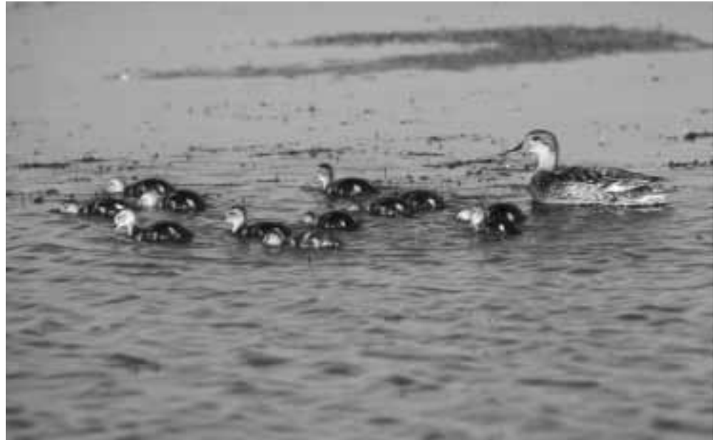
Mallard with brood.

The Service recently stepped up its proactive efforts to prevent electrocutions of migratory birds in the Rocky Mountain region, where urban sprawl and industrial growth have introduced powerlines and poles into areas long inhabited by eagles and other raptors. These large birds of prey are