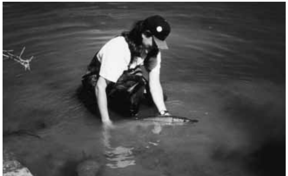
Flathead reservation fisheries work.

In the Southwest Region, the Native American Liaison worked with the Jicarilla Apache Tribe, the Service, the Running Elk Corporation and the New