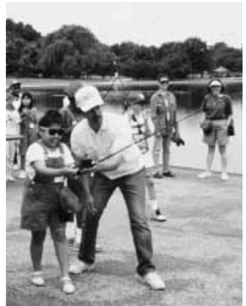
National fishing week.

mostly Native Alaskans, from the Pribilofs to the Brooks Range. These camps helped refuge neighbors develop knowledge and respect for the ecosystem, cultural resources and the skills required to make informed decisions about local natural and cultural resources.