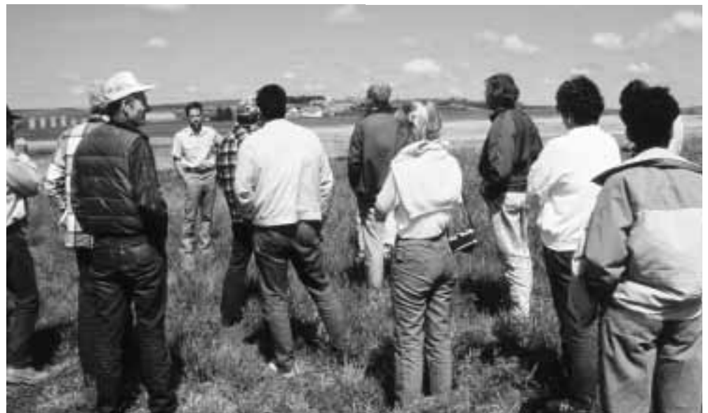
Partnership with private landowners. USFWS