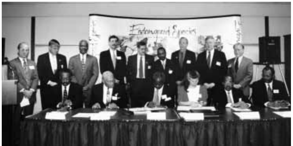
Partnership signing ceremony for U.S. Fish & Wildlife Service and Historically Black Colleges and Universities.

In the Service's ongoing effort to increase its work force diversity and outreach, several Memoranda of Understanding (MOUs) were signed with various minority organizations, including the National Hispanic Environmental