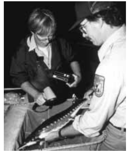
Sturgeon research.

Law Enforcement, Federal Aid — these are crucial programs that need to be strengthened and adapted in order for us to achieve our conservation mission. I intend to dedicate a good deal of my time to help prepare these programs for the challenges ahead.