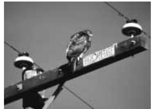
Rough legged hawk.