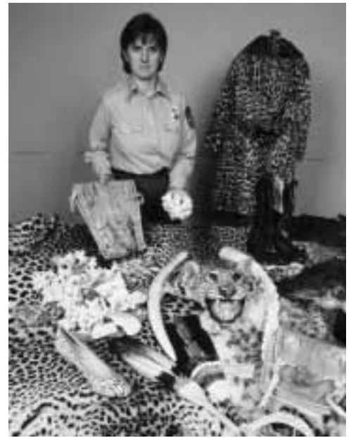
Illegal wildlife trade products.