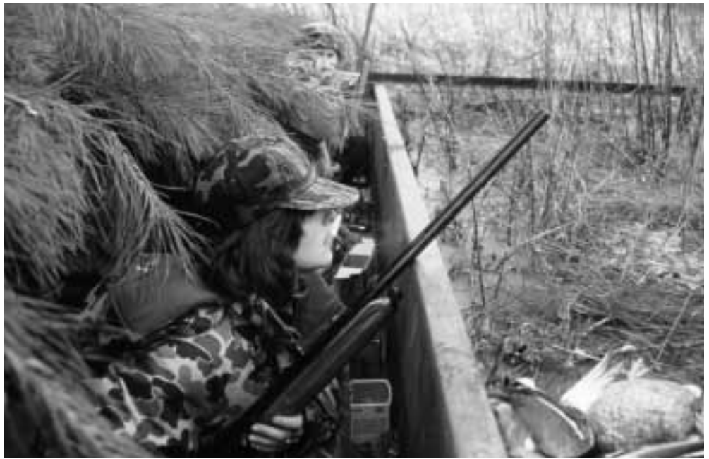
Waterfowl hunting.

The Great Lakes Basin Ecosystem Team has also made a difference, creating the lake sturgeon research Internet homepage ( http://www.fws.gov/r3pao/sturgeon ), which provides background information, calendars, contact numbers and extensive sturgeon-related links. The homepage serves as a nexus for groups working to conserve this prehistoric fish. The Great Lakes team also served as a resource for Congressional inquiries during the reauthorization of the Great Lakes Fish and Wildlife Restoration Act.