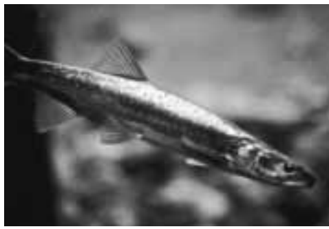
Colorado pike minnow.

In the nation's heartland, we acquired 9,325 acres in Flathead County, Montana,