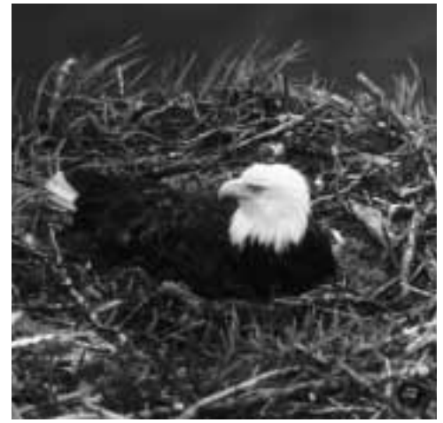
Bald eagle.

The Partners for Fish and Wildlife Program has also been active in Florida, another place where invasive species are causing severe problems. The Service recently completed five projects in South Florida involving projects to eradicate and control invasive species on 216 acres and 1.1 miles of riparian habitat. Collectively, these projects benefit many threatened and endangered species including the wood stork, snail kite, bald eagle, and eastern indigo snake. These activities also contribute to the South Florida Ecosystem Team’s Ecosystem Plan.