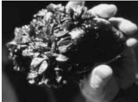
Zebra mussels on native mussel.

Through recent budget initiatives, the Service is expanding its leadership role to include terrestrial invaders, a focus on