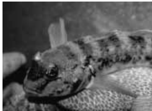
Round goby.

I’m pleased to note that the Service is leading by example in addressing the biological threats posed by invasive species. For example, we’re keeping tabs on the round goby, a native of central Asia, in an attempt to keep it from moving out of the Great Lakes and into the Mississippi River navigation system. Along with a host of partners, we’re