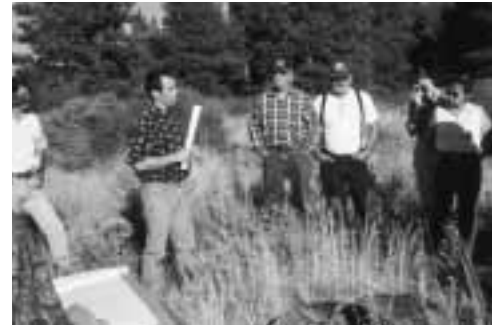
Archeological training.