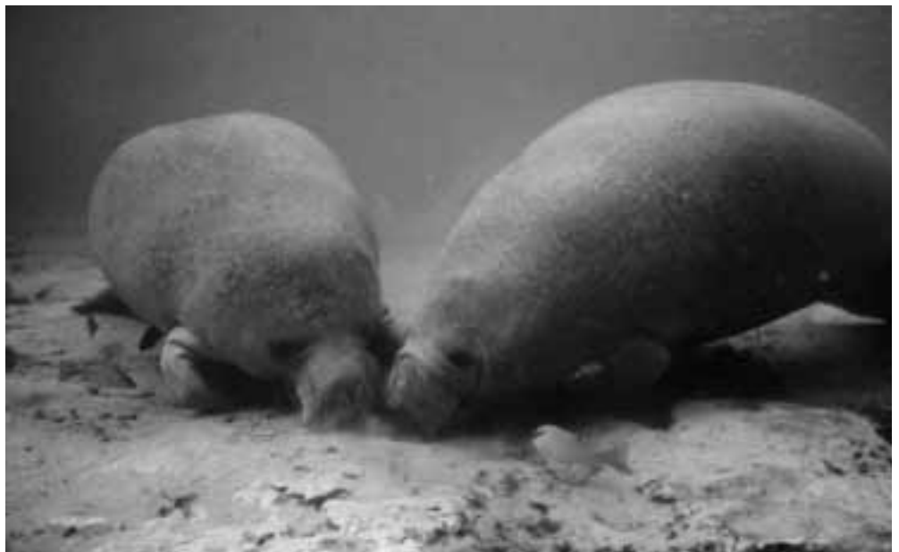
Manatees.

The Division of Law Enforcement contributed to U.S. and global efforts to protect coral reefs, nearly 60 percent of which are imperiled by human activity. Enforcement staff chaired the trade subgroup of the Presidentially created U.S. Coral Reef Task Force, directing an